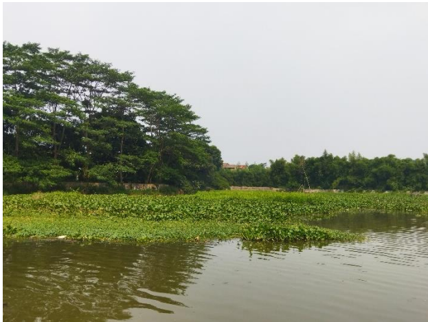
Figure 2. Condition of Water Hyacinth in the Inlet Area

The growth of the water hyacinth at the study site looks very high. At the inlet point (Figure 2), the high growth of water hyacinth causes siltation at the bottom of the lake. Silting that occurs can disrupt the sustainability of lake biota, reduce lake discharge, and in the long term can cause a reduction in the area and age of the lake.