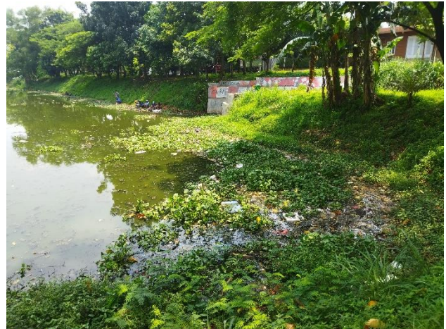
Figure 3. Condition of Water Hyacinth in the Outlet Area

lake, it was also stated that the macrozoobenthic diversity index was included in the low category [29]. Apart from water hyacinth, the presence of macrozoobenthos can also be used as a bioindicator for contamination of an aquatic ecosystem. It confirms that TM lake has experienced environmental degradation and water quality pollution.