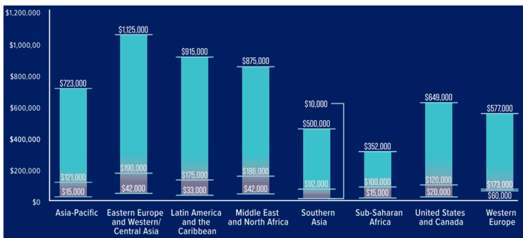
Figure 1. Fraud Index Globally